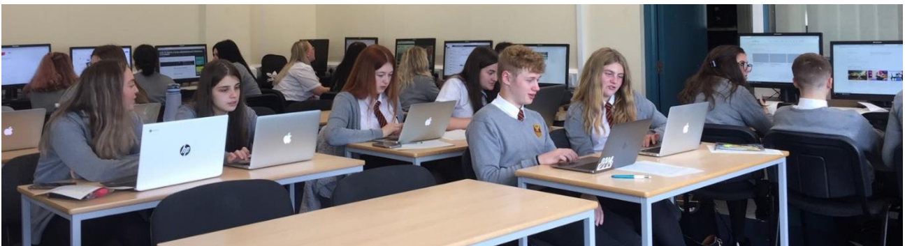
Year 13 students researching university courses and drafting their personal statements.